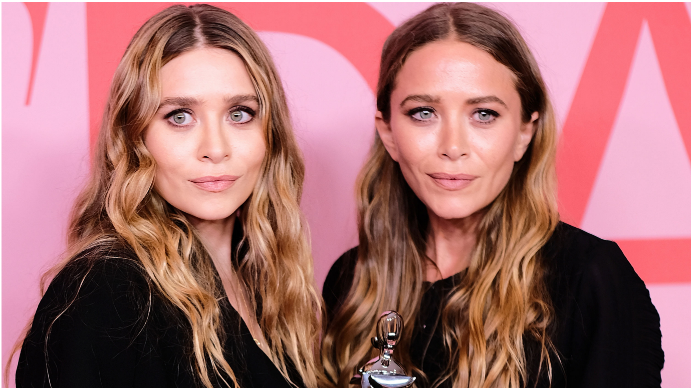
Ashley Olsen, left, and Mary-Kate Olsen pose for photos in 2019.

Mary-Kate and Ashley Olsen are paying tribute to their TV dad.