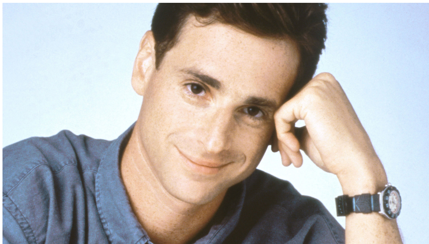
Bob Saget poses for a photo in 1993.

Actor and comedian Bob Saget, though known on the stage and among his friends for his