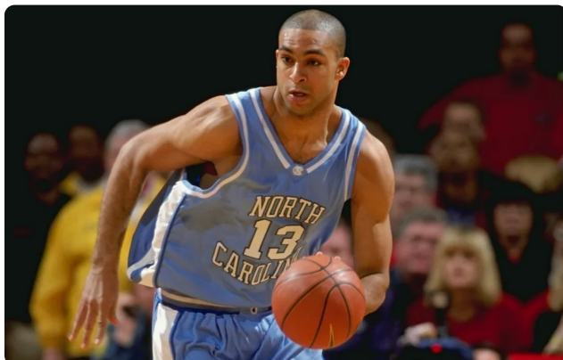
Ademola Okulaja is dead at 46 years old.

Former North Carolina basketball standout Ademola Okulaja has died at 46 years old.