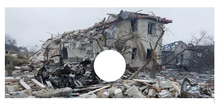
War in Ukraine: Residential areas hit by missile strikes as Russian invasi... As Russia's invasion of Ukraine enters its 7th day, residential areas in the cities of K...

Our goal is to create a safe and engaging place for users to connect over interests and passions. In order to improve our community experience, we are temporarily suspending article commenting.